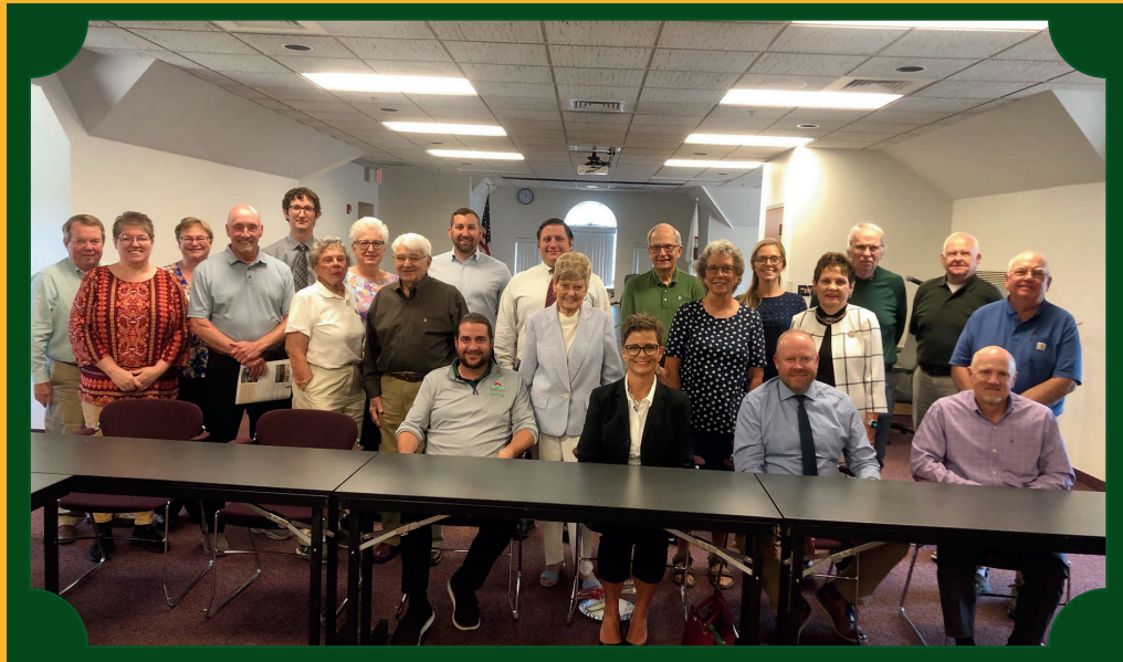
Danville Area Community College Foundation Board of Directors and Staff