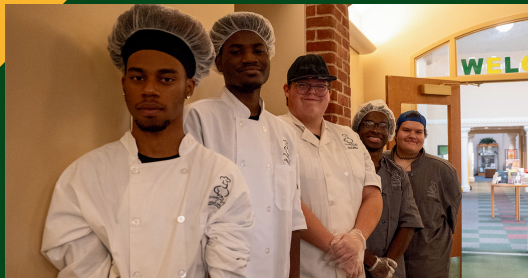
Culinary Students created and served treats for the donors.