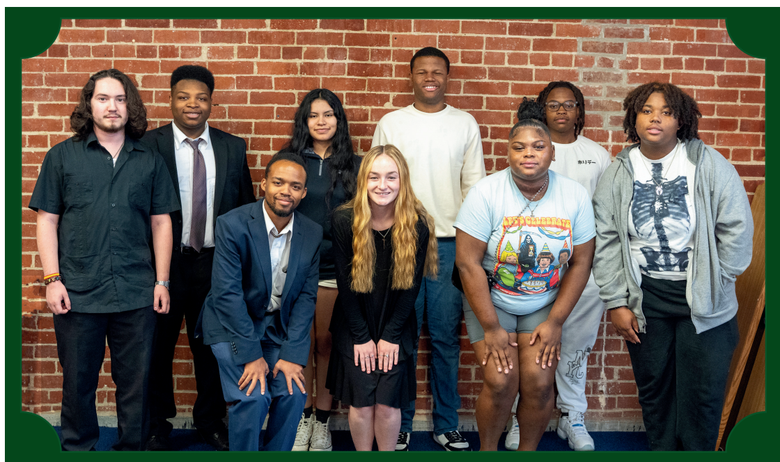
TRIO Scholarship Recipients