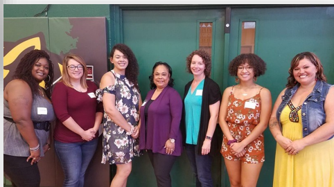
First Midwest Bank Scholarship Recipients